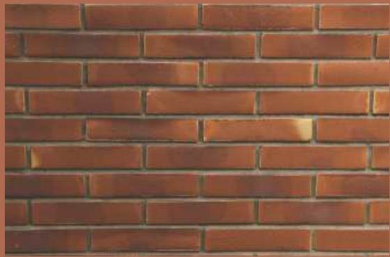
COLOUR : RED