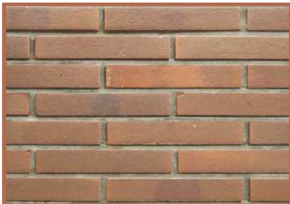
COLOUR : LIGHT BROWN