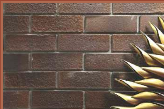
COLOUR : DARK BROWN

SIZES : 9" x 3", 9" x 2", 9" x 1.5" THICKNESS : 20mm