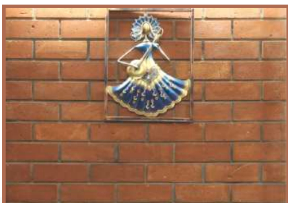
COLOUR : HAND CUTTING TILE RED

SIZES : 210 x 70 x 50/30mm THICKNESS : 14 / 20mm