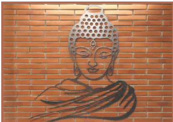
COLOUR : RED