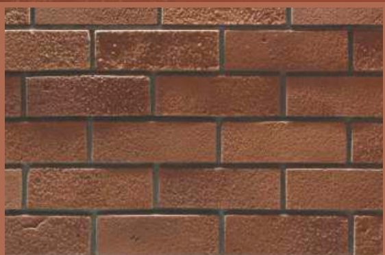
COLOUR : RED

SIZES : 9" x 3", 9" x 2", 9" x 1.5" THICKNESS : 20mm