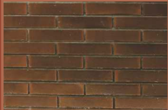
COLOUR : BROWN