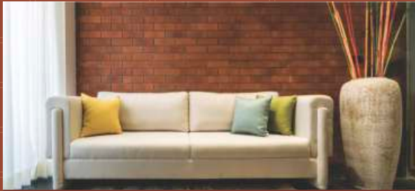
PROJECT : OFFICE INTERIORS : STELLAR BUILDING ARCHITECT : YESHA VAIDHYA LOCATION : SINDHU BHAVAN ROAD, AHMEDABAD