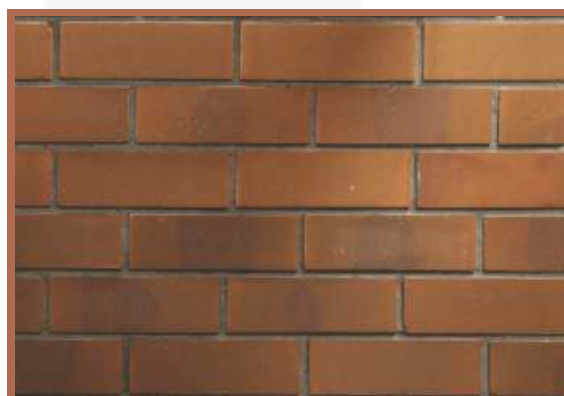
COLOUR : LIGHT BROWN