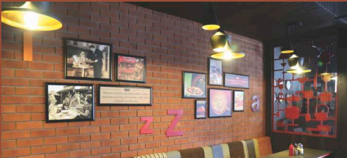
PROJECT : RESTAURANT : PIZZA ZONE | LOCATION : ANJALI CHAR RASTA, AHMEDABAD