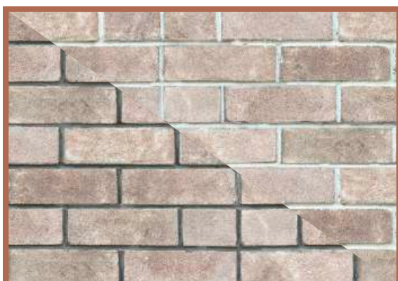
COLOUR : HANDMADE OAK BUCK

SIZES : 210 x 70 x 50/30mm THICKNESS : 14 / 20mm