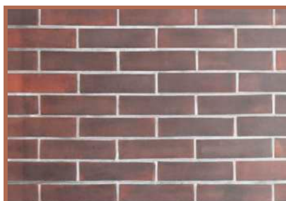
COLOUR : BROWN

SIZES : 9" x 3", 9" x 2", 9" x 1.5" THICKNESS : 20mm