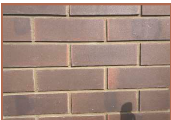
COLOUR : DARK BROWN

SIZES : 9" x 3", 9" x 2", 9" x 1.5" THICKNESS : 20mm